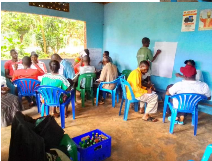
FVTIC Kalungu Training Centre