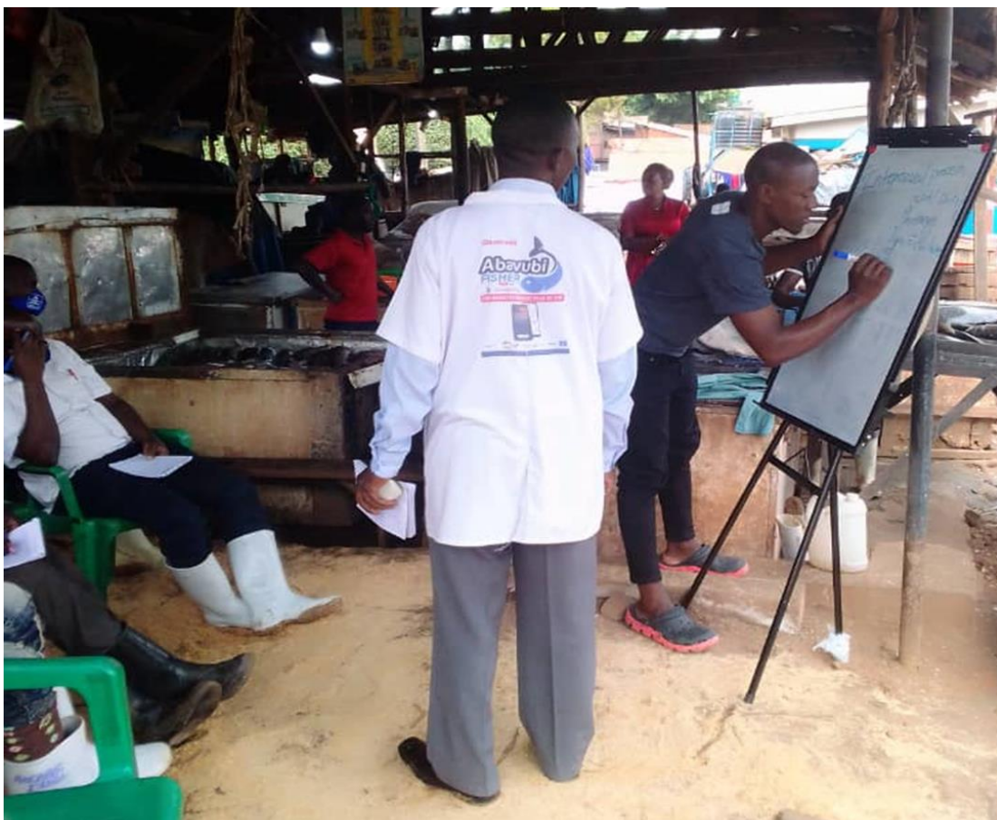
FVTIC Kampala Mulungu Market Training Centre