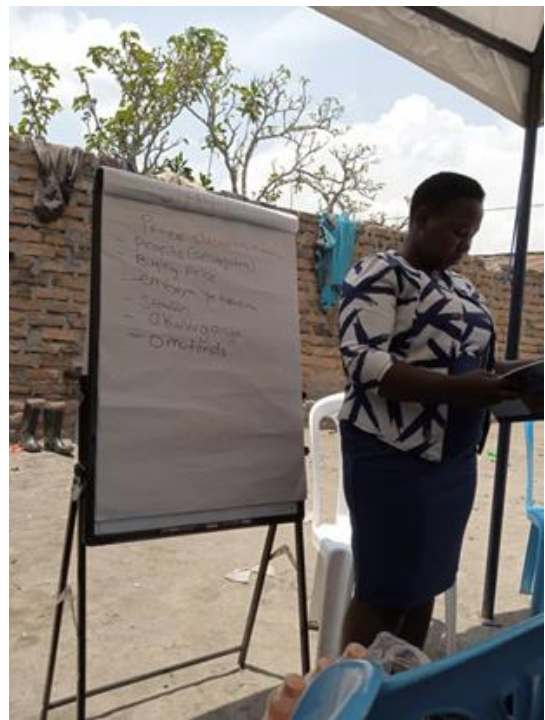
FVTIC Kalungu trainer Training Centre