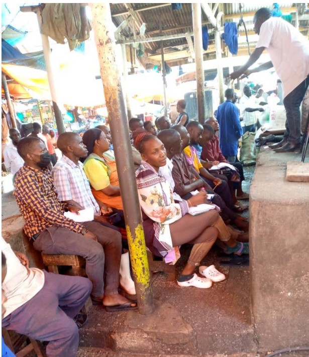
FVTIC Kampala Training Centre