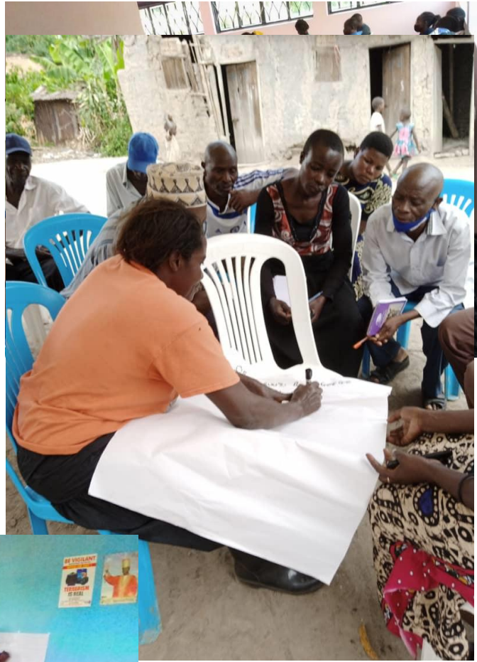
FVTIC Mpigi training centre

It is available for fishermen, women, people with disability, youth and others who wish to start a career or business in Fishery Value Chain business.