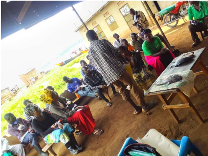
FVTIC Masaka Training Centre