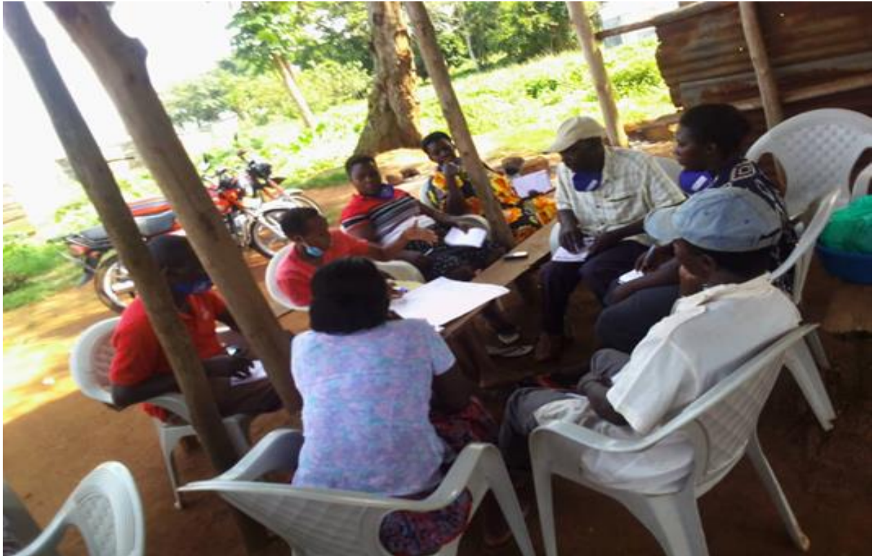
FVTIC Kyotera Training Centre